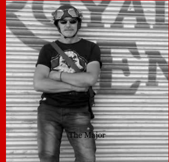
Le Principal (The Major) - relaxing

Prices are based on two persons sharing a room and guests are encouraged to ride their own motorcycles.